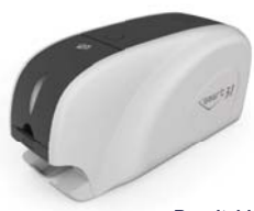
Rewritable ID CARD PRINTER smart-31 R